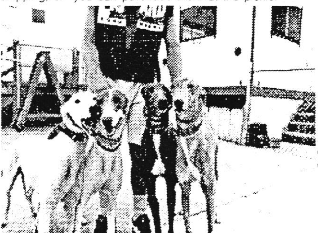
WHITE, WHITE & BLUE, BLUE & BLUE BRINDLE

Some of our adopters who are "repeat customers"- who have gone on to adopt a second or even a third greyhound-have found that it can be a challenge to walk 2 or 3 dogs on 2 or 3 leads, the leashes get wrapped around each other the dogs, you, etc. We have the solution, we are now selling double and triple leash couplers. This is a clip for each dog's collar and the other end clips onto a single leash with a loop to hold onto. They're great for 2 or 3 greyhounds but should also work for a greyhound and another dog of comparable size and stride (i.e., not a greyhound and a minature dachshund!). Available from the Greyhound Store for $5.00 for the double leash and $7.00 for the triple leash, including shipping, or you can purchase them at the picnic.