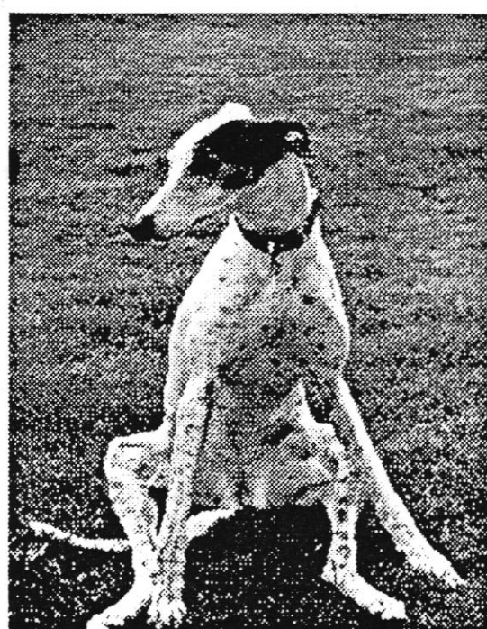
AND THEY SAY GREYHOUNDS CAN'T SIT!

Need a sure-fire way of identifying your luggage while on a trip? There's no better way than having a personalized luggage tag with your name on one side, as well as a picture of your greyhound on the other. If there are enough volunteers available at the picnic, luggage tags will be made and sealed in plastic with appropriate tags on the end at $1.00 each. The luggage tag size is indicated below, so that you can bring pictures that are the appropriate size to the picnic, as well as copy information for the other side of the tag with you. Don't miss out, bring you pictures and ID's to the picnic!